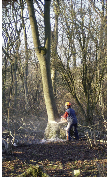
Opening up overgrown woodland will improve conditions for many flowers, butterflies and other wildlife

21. Saturday 17 December MARTIN DOWN (NE) Scrub clearance. Meeting place: SU036200. Large car park off the A354. Leaders: Rob Lloyd and Sue Fitzpatrick 01 722 41 0807 (GS).