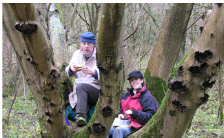
Picnic in the trees

35. Sunday 26 February EMMETT HILL MEADOWS, Minety Ditch and pond clearance. Meeting place: SU010907. Park on south side of road verge between Minety and Upper Minety west of Dog Trap Lane. Leader: Paul Darby 01380 724654.