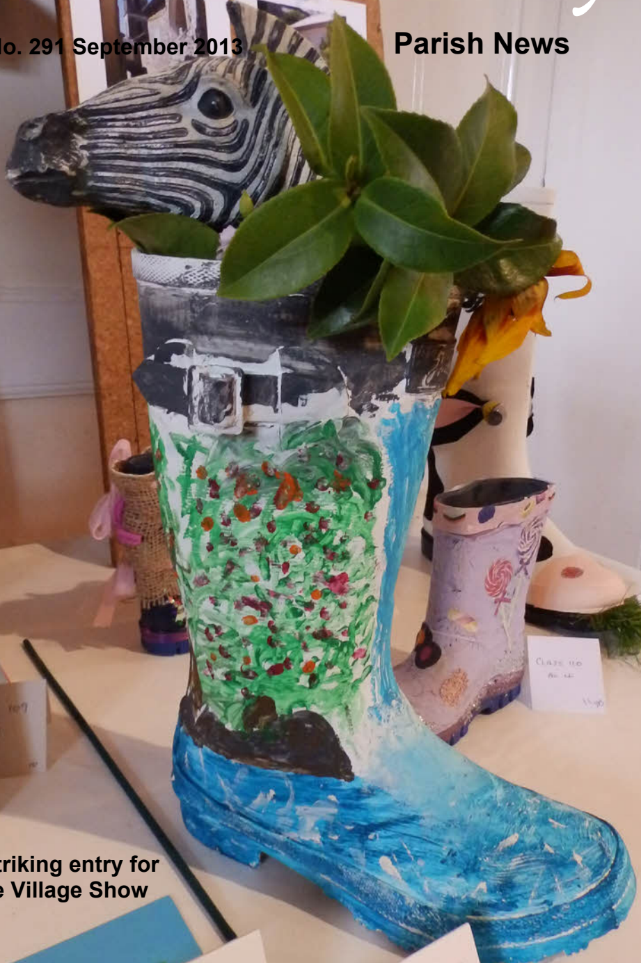
A striking entry for the Village Show