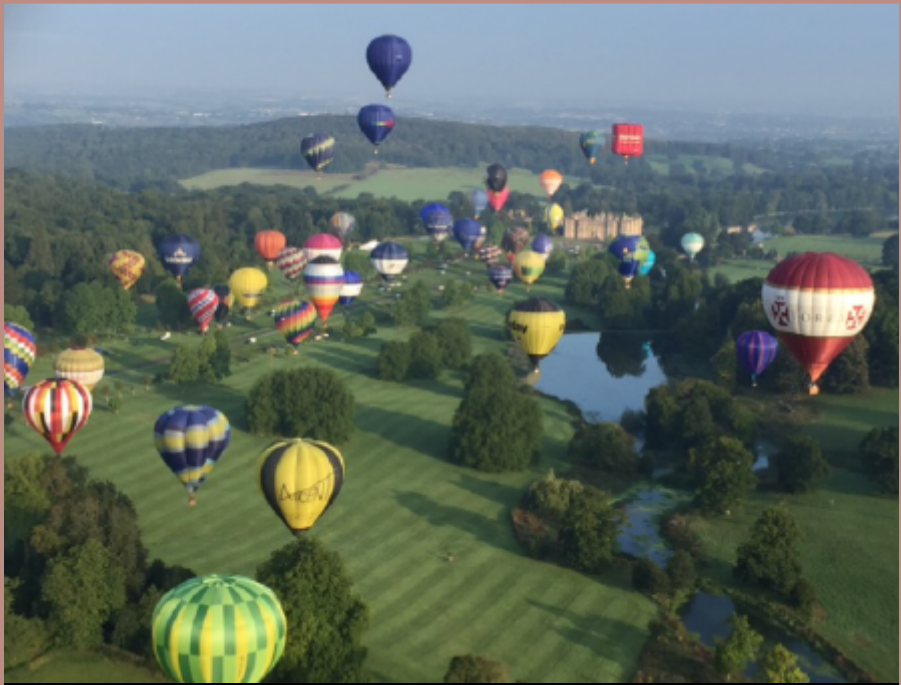
Longleat Balloon Safari Dark skies over Knowlton Church