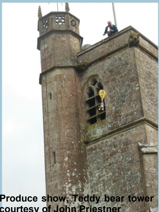
Various pictures from the Village Produce show, Teddy bear tower jump & Church Flower Festival