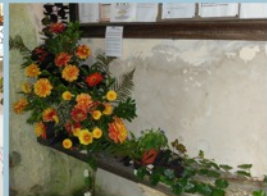
A selection of entries from Maiden Bradley Church Flower festival