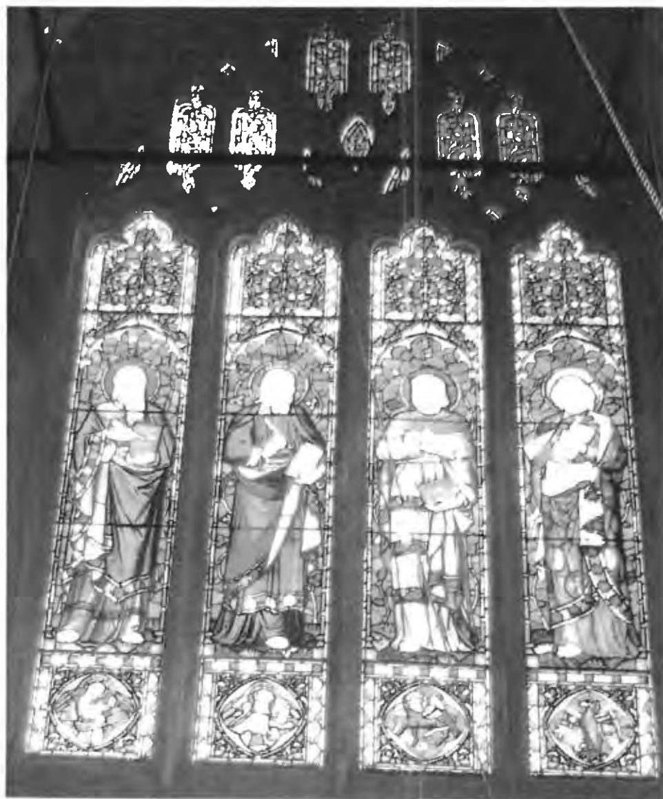
STAINED GLASS WINDOW FOVANT CHURCH JE

YOUR VILLAGE & AREA NEWS AND MEETINGS ARTICLES VILLAGE AND AREA EVENTS POLICE REPORT ADVERTS